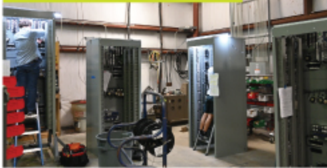
Assembly in Shop

We deliver stand-alone device retrofits & complete, customized turnkey packages.